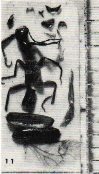
Fig. 11, Protomeloe argentinensis Abdullah, holotype, male, in the collection of the California Academy of Sciences, San Francisco. (1 division on the scale= 1 mm).

Eletica as the most primitive genus of Meloidae. Whether or not his action in placing of Eletica in a new subfamily is justified, I consider there is good reason for placing Protomeloe in a distinct subfamily, occupying a more or less intermediate position between Anthicids (including Pedilids) and other Meloids. If it is considered useful to reduce the number of families within the section Heteromera of the superfamily Cucujoidea, one should think of merging the families Anthicidae and Meloidae.